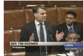
Fig. 1. A C-SPAN frame with on-screen graphics identifying the speaker.

Screen graphics in news broadcasts and documentaries provide information on where , when , and who of the video content. An example of a video frame with an on-screen graphics section providing the name and title of the speaker in the shot is shown in Figure 1. C-SPAN programming exclusively contains news programs, speeches, and meeting proceedings; therefore the graphics insertion requirements are larger compared to typical television programs. Currently on-screen graphics for C-SPAN programs